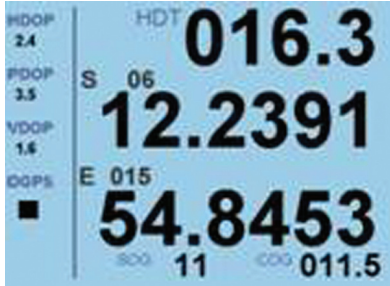
Vessel Position and Heading

The G2 Navigator displays valuable information with a touch of a button!