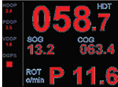
Heading and Speed