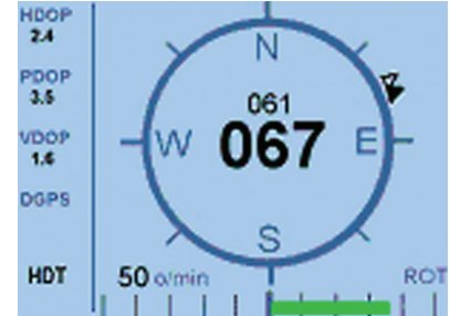
Compass Rose Heading

Additional screen displays: GPS satellite status, configure Vector G2/G2B GPS compasses & monitor NMEA 0183 generic sentences.